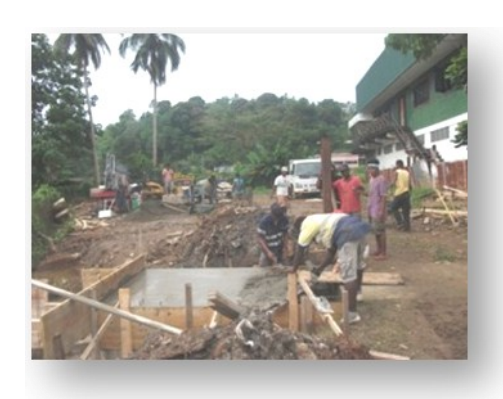
Site clearance for the commercial building.

The Diocese of Gizo will soon have a new Commercial building here in Gizo- in the China town area.